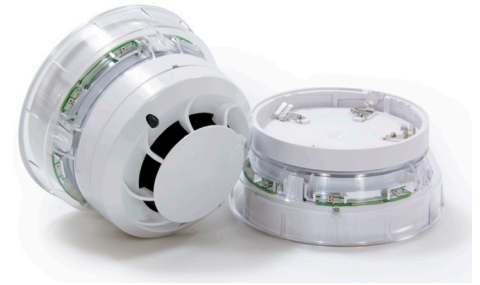
Detector purchased separately

Important Note: To achieve an IP21C rating, the provided seal must be fitted to the product.